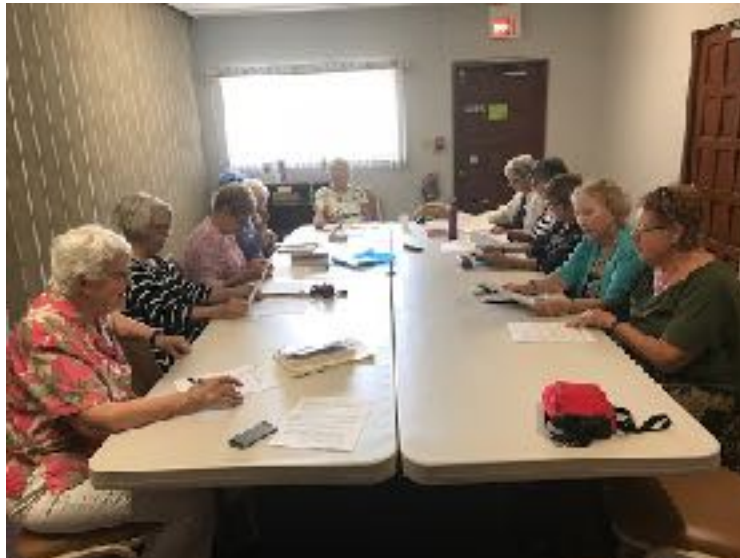
Although the above is a book discussion group, it is descriptive of a community meeting

The structure of Mary Mother of Jesus is organic in that no permanent committees exist except one-the MMOJ non-profit board which oversees finances for the community as it is required by Federal and State laws.